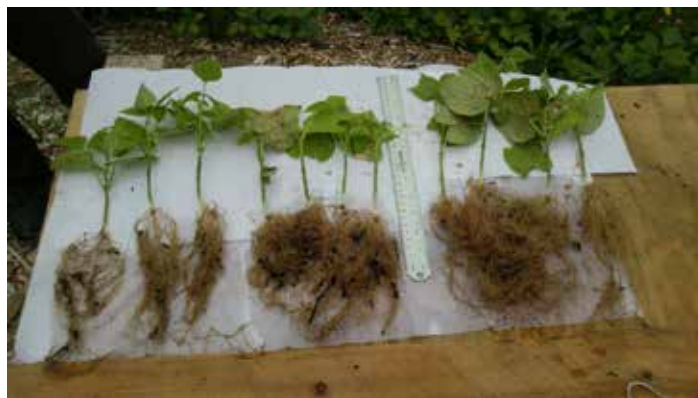
A biochar experiment

washes down past the root systems of the plants. Making the fertilizer more available to crops saves money, reduces water requirements, and reduces the creation of nitrous oxide.