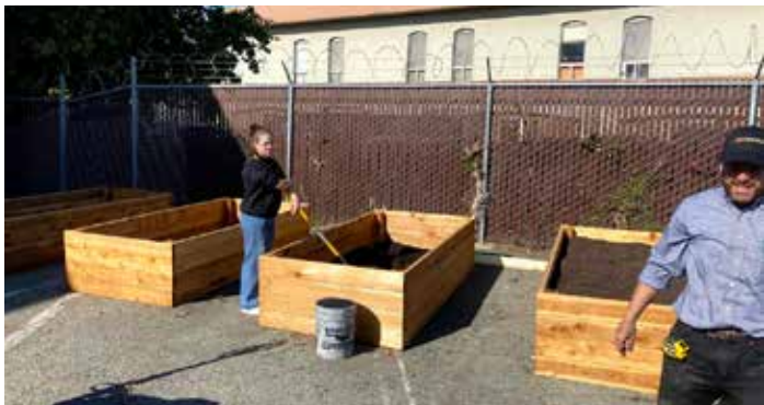
The Anioch site